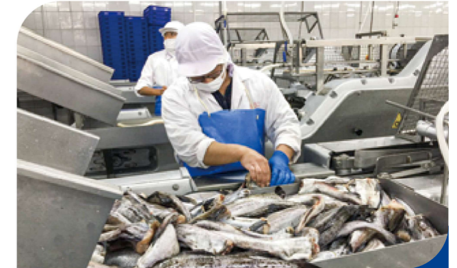
机器: 24-36 条 / 分钟 Machine: 24-36fish/min

Start suitable quantities of filleting machines flexibly according to production plan.