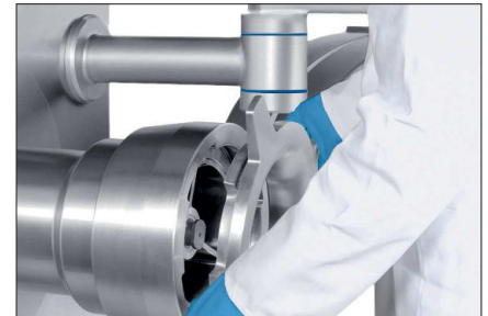
Bayonet locking (optional)