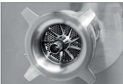
Outside knife (optional)