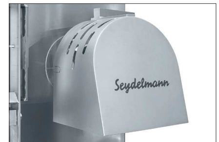
Outlet protection device (optional)