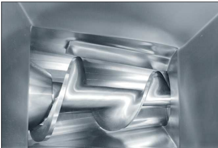
Top view: Hopper