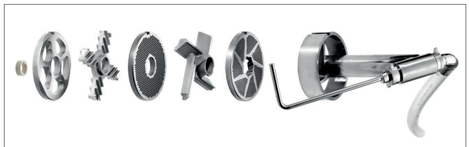
Separating set (optional)