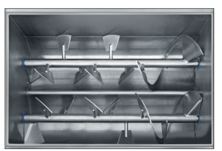
Top view: Hopper