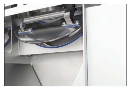
Hydraulic discharge flap