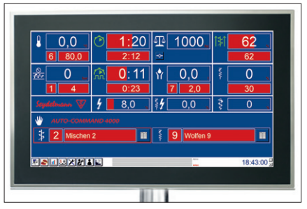
Auto Command Touch 4000 (optional)